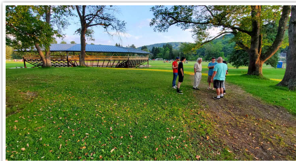
SK8EVL Committee members meet with Village of Ellicottville Mayor John Burrell at the proposed location of the skatepark within the Village Park.

The proposed location of the Ellicottville Skatepark is in the Ellicottville Village Park, Parkside Drive. Construction is slated for summer of 2022.